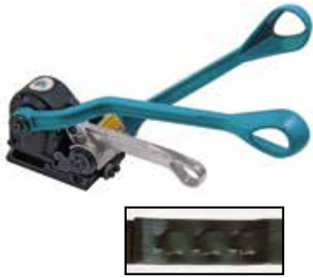
SEALESS DIE CUT JOINT