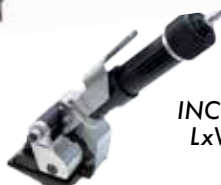
INCLINED SP3100 (SPECIAL) LxWxH = 9" x 6.5" x 10.5"

USE WITH ABOVE SP6119, SP6125 & SP6132 SEALERS