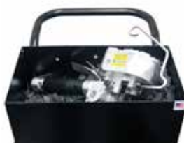
XL Tool Bin Stores Tools and Seals