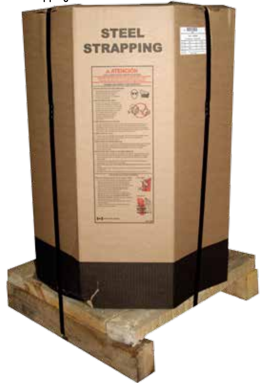
Packed Steel Strapping