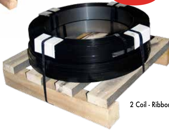
2 Coil - Ribbon Wound