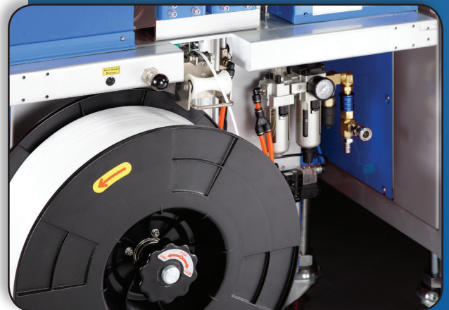
Auto Strap Feeding