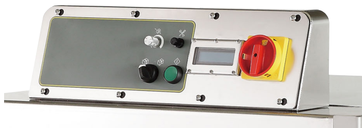
PC1500SS Control Panel

applicable in moist and harsh working environments such as meat/poultry processing plants and the marine food industry.