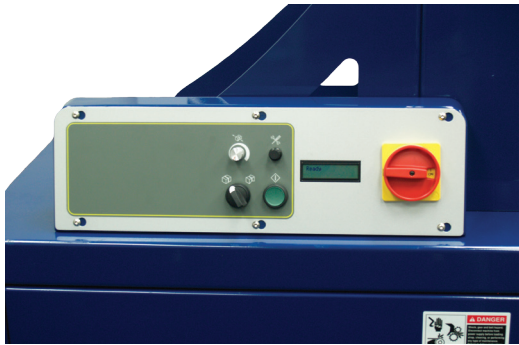
PC1500 Control Panel

PC1000 strapping head in a side seal configuration. The side mounting prevents debris from contaminating the seal head. This machine is the most cost effective solution to your strapping requirements in its class today.