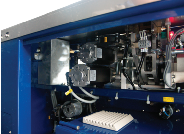
German DC Brushless Motors

The PC1500 is an innovative high speed automatic strapping machine. It is equipped with all industry standard features. The PC1500 offers optimal performance, high cycle speed and easy maintenance. The PC1500 is the same reliable