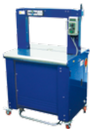
(5mm to 3/8")