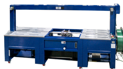
Strap Head and Seal Position are Centerline