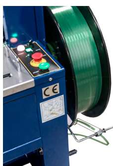
Utilizes large 16" x 6" core PP or PET Strapping