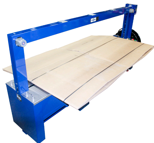
Great for Reinforcing Large Cartons

The PC 9800 is designed for precision controlled strapping on larger products like collapsed cartons and windows and doors. The PC 9800 features the flexibility to run either polypropylene or polyester strapping which allows you to strap a variety of applications.