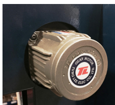
Two Assist Motors for Positive Strap Feeding

The PC 9800 is designed for precision controlled strapping on larger products like collapsed cartons and windows and doors. The PC 9800 features the flexibility to run either polypropylene or polyester strapping which allows you to strap a variety of applications.