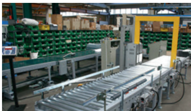
Packaging line with 0875 & TR200 and conveyors