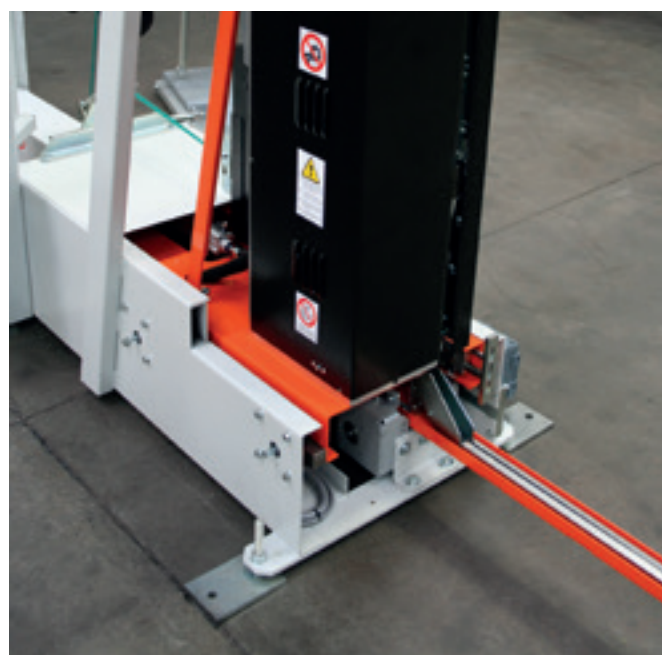
Sword-bayonet to strap through pallet void