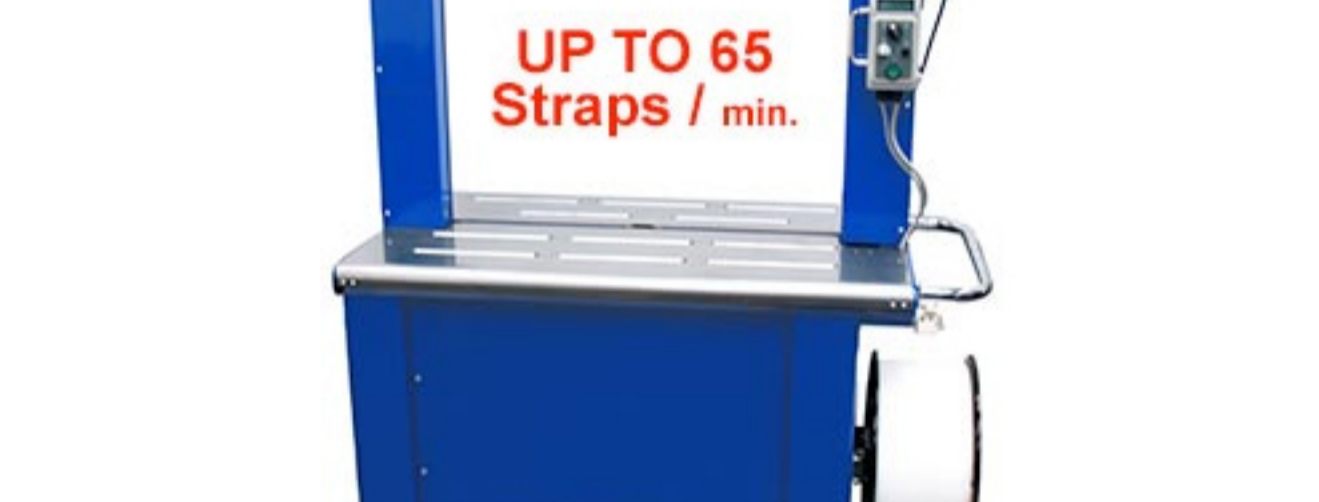
Bulk Packaged AAR Strapping