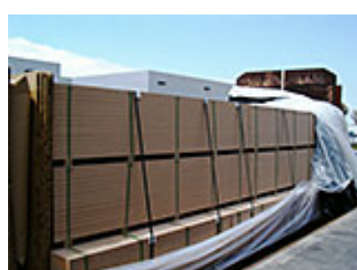
BANDS FOR RAIL SHIPMENTS