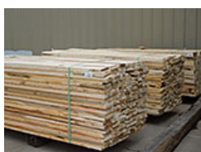
ROUGH CUT LUMBER