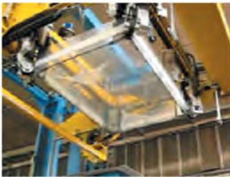
Film Stretching (Note: "Dog ears" or "elbows" are inside the hood)

The structure of this machine was designed for heavy industrial use.