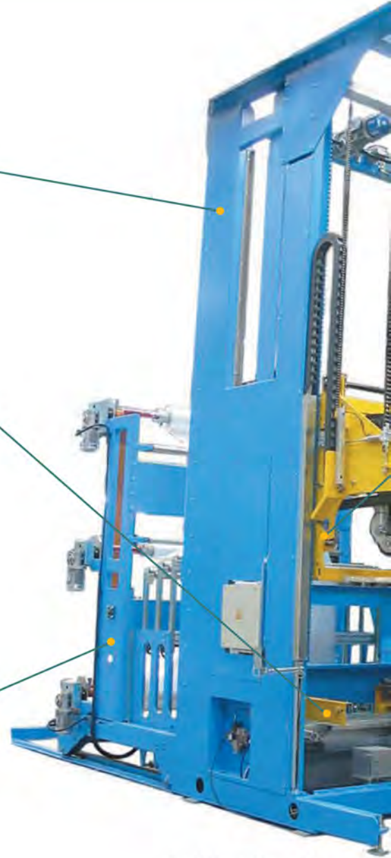
Small Footprint – Takes up Less

This unit is capable of operating simultaneously with 1, 2, or 3 size film rolls.