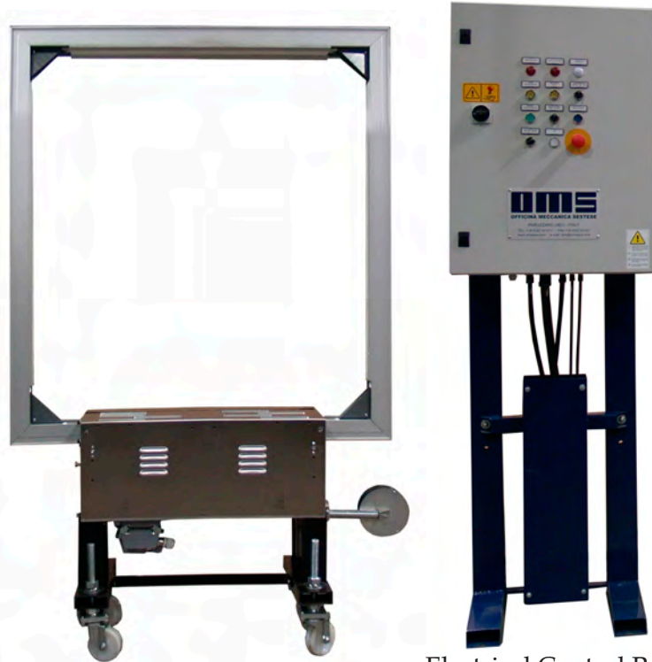
Electrical Control Panel

Polychem's standard bottom seal machine can be customized to meet your specific packing needs. They provide the same reliability and robust construction of the larger machines. These machines can be integrated with powered conveyors for fully automatic processes or they can be coupled with gravity conveyor for semi-automatic processes. Polychem's bottom seal machines are used in applications that require the package height to be fairly low or may vary in height. They are less expensive than top seal machines.