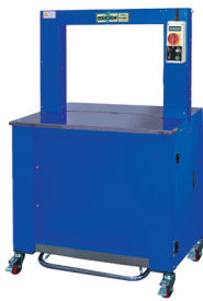
(5mm to 3/8")